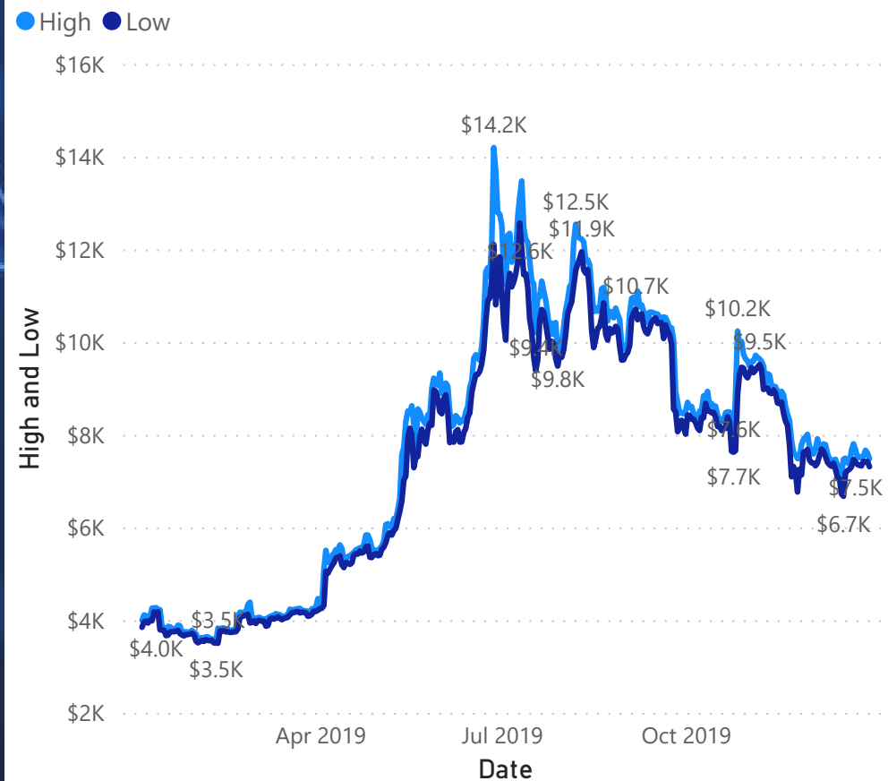
High and Low by Date